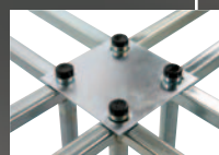
4 Hole linking plate