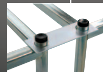
2 Hole linking plate