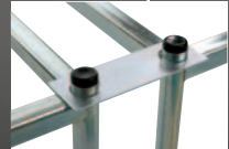
2 Hole linking plate