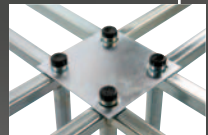
4 Hole linking plate

ALSO AVAILABLE FOR HIRE Rates and details on request. Freephone 0800 542 1726